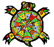
Friends of San Tan Mountain Regional Park